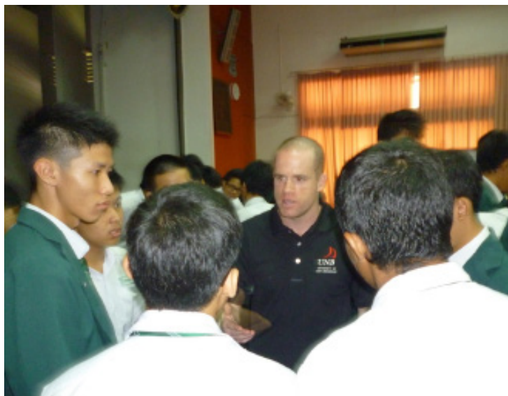
Recruiting in Malaysia

To begin, we have an action-packed schedule that will cover most of the globe. This year, our three international recruiters will be active in: Africa, Brunei, the Caribbean, China and Hong Kong, England, Europe, Indonesia, Japan, Latin America, Malaysia, Oman, Qatar, Saudi Arabia, Singapore, South Korea, Toronto and Vancouver, Vietnam, the U.A.E., and the Eastern United States. To see where our recruiters will be at any given time, drop by our new website at: www.unb.ca/international/prospective .